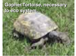
Gopher Tortoise, necessary to eco system.

An odd little creature that inhabits this land is the five-inch long Florida Sand Skink, which is found only in the Lake Wales Ridge area. It looks like a snake, but has little legs. He "swims" under the surface of the sand. We didn't see any, as they are rarely seen, but we did see their tracks here and there. The sand skink has no known relative. One of the most valuable critters in the delicate ancient ecosystem is the equally ancient Gopher Tortoise. He digs a tunnel that can be as much as 30 feet long, which, amazingly enough, is used by other animals in traumatic times (fires and other threats) to wait it out. Unknown by science is how these natural enemies (mouse, snake, fox, etc.) can co-exist in the same space during these times. Some 300 species have been recorded using a gopher tortoise hole at one time or another.