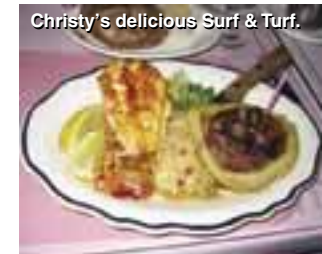
Christy's delicious Surf & Turf.

For breakfast everyone heads to the Cypress Cafe, where you can get pretty much anything you can think of for breakfast, and