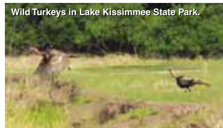
Wild Turkeys in Lake Kissimmee State Park.

We took a pontoon boat ride, captained by James Erskine, through Tiger Cove and Tiger Creek. It is a wonderful experience to view just natural Florida as far as you can see, and spot great bald eagles soaring in the sky, watching along the shore line for gators (was that a stick of wood or a gator snout?)