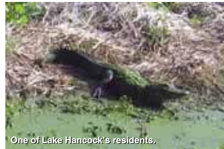
One of Lake Hancock's residents.

Some folks take night hikes in the reserve, but we, the chicken-hearted, are not