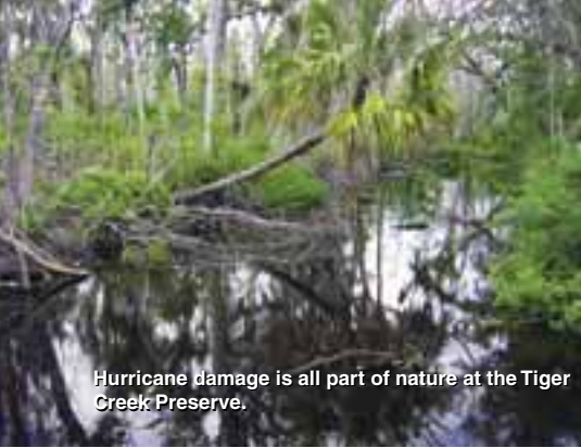
Hurricane damage is all part of nature at the Tiger Creek Preserve.

still used today to dye some red-colored beverages, candies, medicines, and lipstick. (This may be more information than you care to know!)