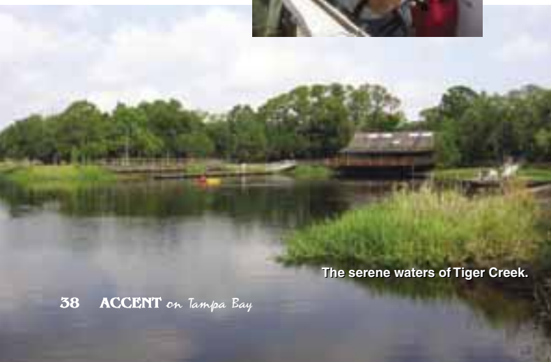
The serene waters of Tiger Creek.