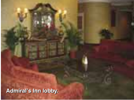
Admiral's Inn lobby.

W e checked into the Best Western Admiral's Inn in Winter Haven, which is a good central point for visiting the natural preserved areas of Central Florida. It's also right next door to Cypress Gardens, so bring the kiddies! The hotel guest rooms have an old world comfort, with dark woods, hunter